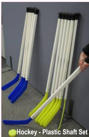
Hockey - Plastic Shaft Set